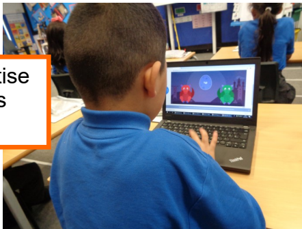
Year 1 practise their phonics every day.