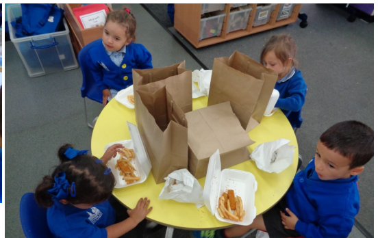
Nursery enjoy eating their fish and chips lunch in a bag.

Do you have any questions about school life?