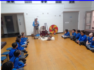
Year 5 history workshop on Vikings